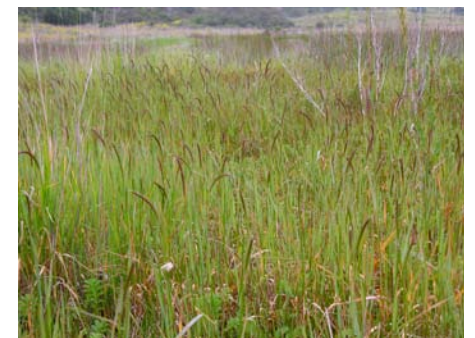
Poaceae - Hordeum brachyantherum (California barley)