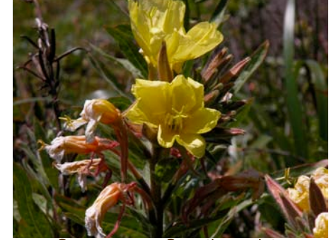
Onagraceae - Oenothera elata ssp. hookeri (Hooker's evening primrose)