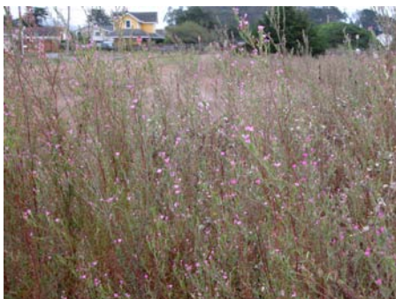
Onagraceae - Epilobium brachycarpum (panicked willow herb)