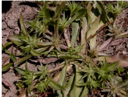
Apiaceae - Eryngium armatum (coastal eryngo)