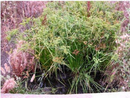
Cyperaceae - Cyperus eragrostis (tall cyperus)