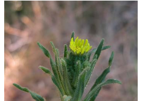
Asteraceae - Madia sativa (coast tarweed)