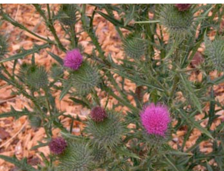
Asteraceae - Cirsium vulgare (bull thistle) non-native