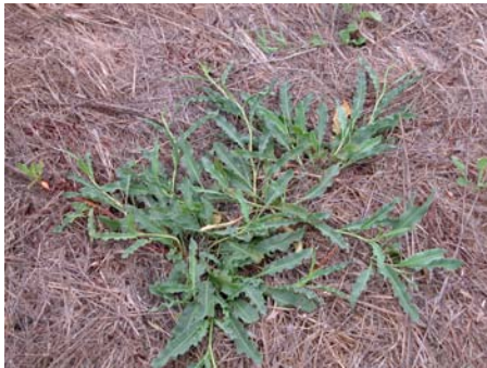
Polygonaceae - Rumex salicifolius (willow dock)