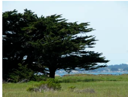
Habitat - grassland/cypress trees