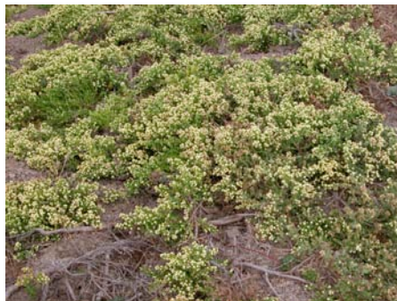
Asteraceae - Baccharis pilularis (coyote brush)