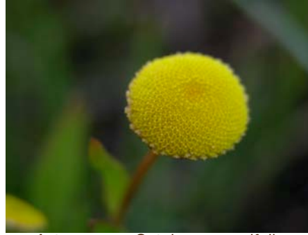
Asteraceae - Cotula coronopifolia (brass-buttons) non-native