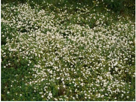
Boraginaceae - Plagiobothrys chorisianus (Choris' popcorn-flower) rare plant