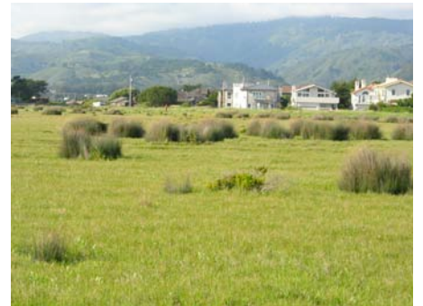
Habitat grassland/wetland bluff top