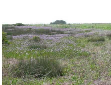
Habitat grassland/wetland bluff top