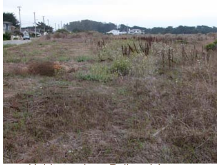
Habitat - along Railroad Avenue Railroad right-of way