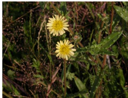
Asteraceae - Picris echioides (bristly ox-tongue) non-native