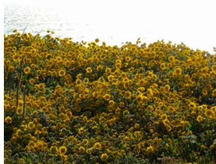
Asteraceae - Lasthenia californica ssp. macrantha (perennial goldfields)