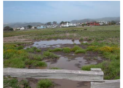
Habitat grassland/wetland bluff top