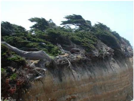
Cupressaceae - Cupressus macrocarpa (Monterey cypress) non-indigenous