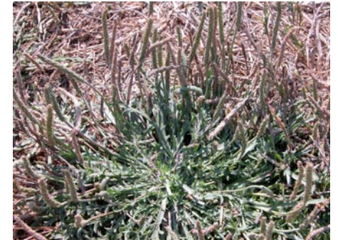
Plantaginaceae - Plantago coronopus (cut-leaved plantain) non-native