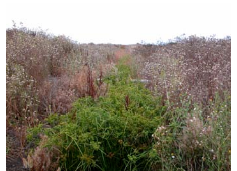
Habitat - wetland

H M B B L U F F T O P S