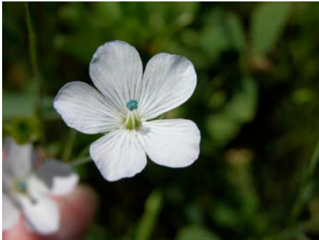
Linaceae - Linum bienne (narrow-leaved flax)