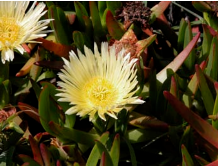
Aizoaceae - Carpobrotus edulis (ice plant) non-native