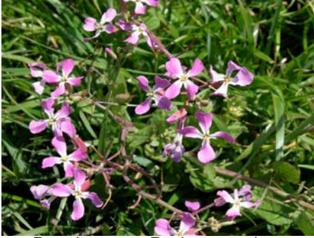
Brassicaceae - Raphanus sativus (wild radish) non-native