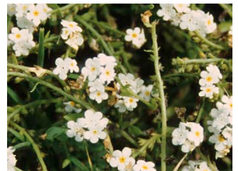
Boraginaceae - Plagiobothrys chorisianus (Choris' popcorn-flower) rare plant