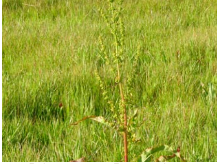
Polygonaceae - Rumex crispus (curly dock) non-native