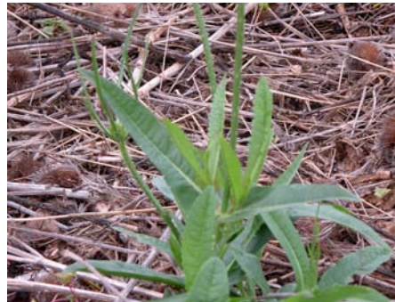
Dipsacaceae - Dipsacus species (teasel) non-native