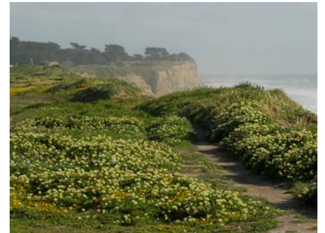
Fabaceae - Trifolium fucatum (sour/bull clover)