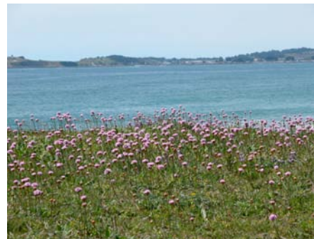
Plumbaginaceae - Armeria maritima ssp. californica (sea-pink)