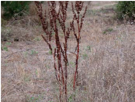
Polygonaceae - Rumex crispus (curly dock) non-native