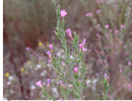
Onagraceae - Epilobium brachycarpum (panicked willow herb)