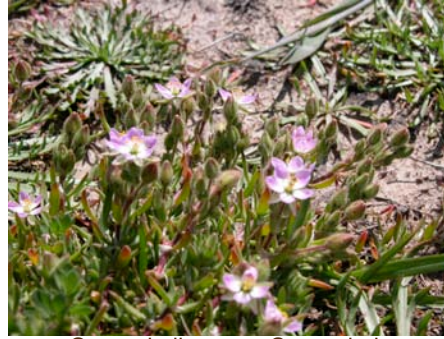
Caryophyllaceae - Spargularia macrotheca var. macrotheca