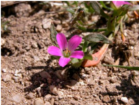
Portulacaceae - Calandrinia ciliata (Red Maids)