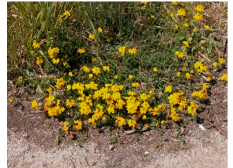
Fabaceae - Lotus corniculatus (birdfoot trefoil) non-native