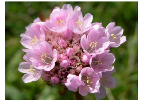
Plumbaginaceae - Armeria maritima ssp. californica (sea-pink)