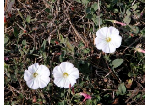
Convolvulaceae - Convolvulus arvensis (bindweed) non-native