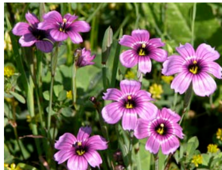
Iridaceae - Sisyrinchium bellum (blue-eyed-grass)