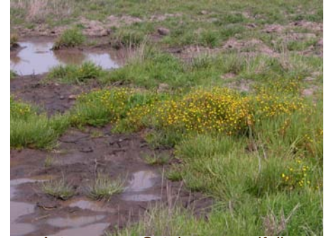
Asteraceae - Cotula coronopifolia (brass-buttons) non-native