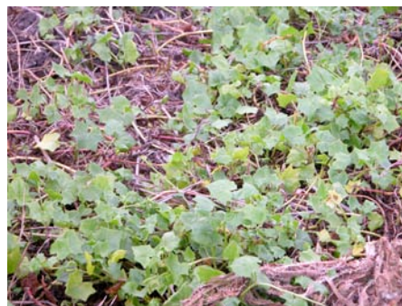
Asteraceae - Senecio mikanioides (Cape-ivy) non-native