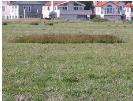
Habitat grassland/wetland bluff top