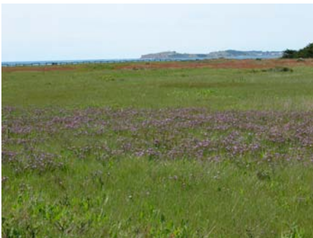
Iridaceae - Sisyrinchium bellum (blue-eyed-grass)