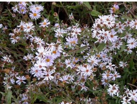
Asteraceae - Aster chilense (common California aster)