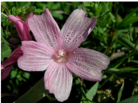
Malvaceae - Sidalcea malviflora (checker mallow)