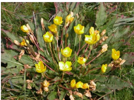
Onagraceae - Camissonia ovata (sun cup)