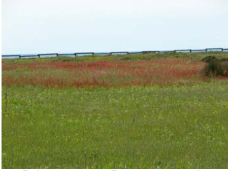
Polygonaceae - Rumex acetosella (sheep sorrel) non-native