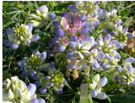
Fabaceae - Lupinus variicolor (Lindley's varied lupine)