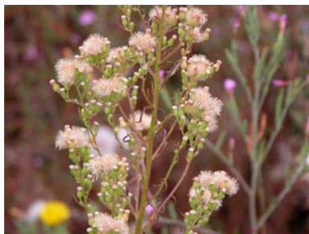
Asteraceae - Conyza canadensis (horseweed)