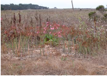
Liliaceae - Amaryllis belladonna (naked lady) non-native