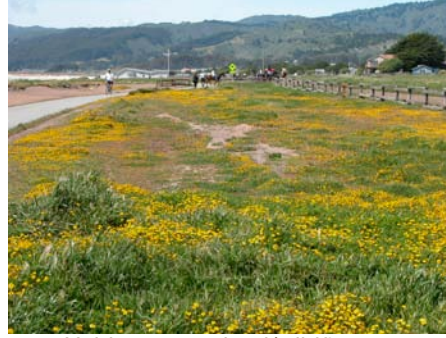
Habitat - grassland/wildflowers bluff top coastal trail