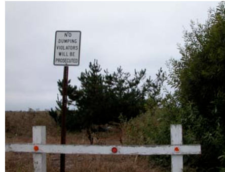
Pinaceae - Pinus radiata (Monterey pine) non-indigenous