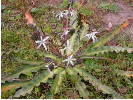
Liliaceae - Chlorogalum pomeridianum (soap plant/amole)