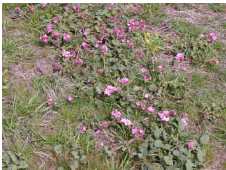
Malvaceae - Sidalcea malviflora (checker mallow)