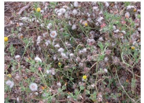
Asteraceae - Picris echioides (bristly ox-tongue) non-native