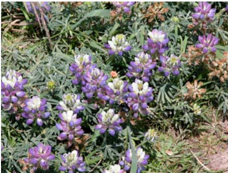
Fabaceae - Lupinus variicolor (Lindley's varied lupine)