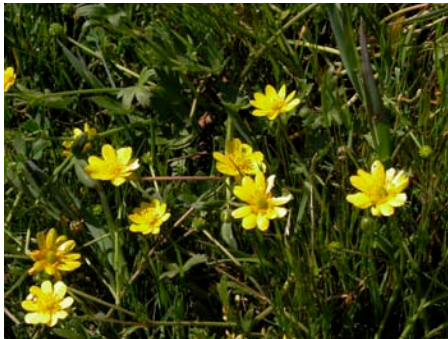
Ranunculaceae - Ranunculus californicus (California buttercup)