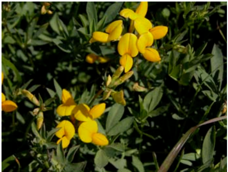
Fabaceae - Lotus corniculatus (birdfoot trefoil) non-native