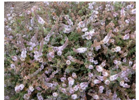
Lamiaceae - Mentha pulegium (pennyroyal) non-native