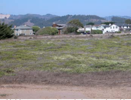
Habitat - coastal scrub (coyote brush) bluff top