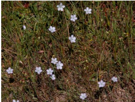
Linaceae - Linum bienne (narrow-leaved flax)