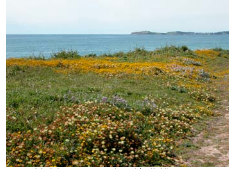
Habitat - grassland/wildflowers bluff top coastal trail