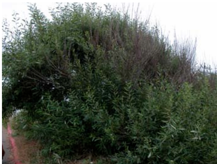
Salicaceae - Salix lasiolepis (arroyo willow)