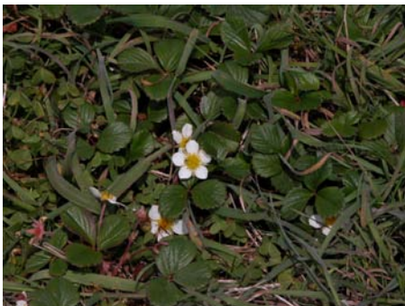
Rosaceae - Fragaria chiloensis (beach strawberry)